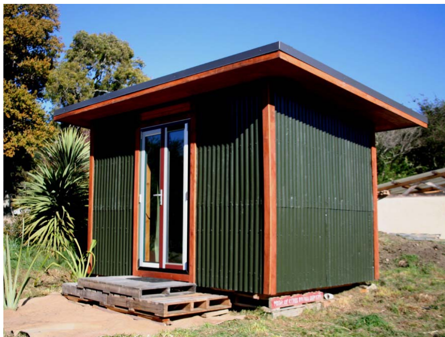
Figure 3: The prototype 'Pozie' eco cabin.

Before we all get too deep in the mire, though, and to keep things simple, I will show you how to build a safe, healthy and comfortable cabin 1 of less than 10m 2 . Such that you may take on an achievable goal and avoid having to apply for a building consent 2 . However, the method for building this cabin is no different from building a small home – for those adventurous enough to experiment further. Later versions of this book will include plans and describe how to do just that: build a one or two-bedroom home from pallets and other recycled waste materials.