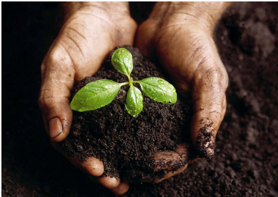
Figure 4: Nature

I am also not the first to realise that in Nature there is no such concept as 'waste' – that the bi-products from one organism are the nourishment for another. Nature produces an ever balanced cycle which is the only real sustainable system. If our species is to survive on this planet, we must start emulating Nature and following her lessons before it is too late.