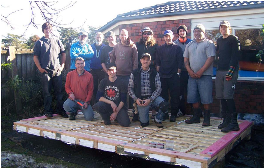
Figure 2: Workshop group June 2012.

My wish for this book is to empower, excite and educate while you enjoy the adventure.